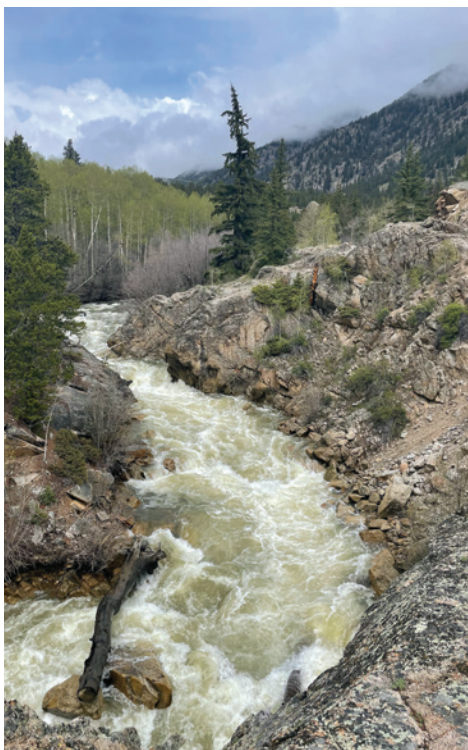
Above: Goat at the Grand Mesa, Grand Junction. Left: The Colorado River, Glenwood Springs.

If you're looking for a java jolt, a drip coffee at Kiln Coffee Bar should do the trick. 24