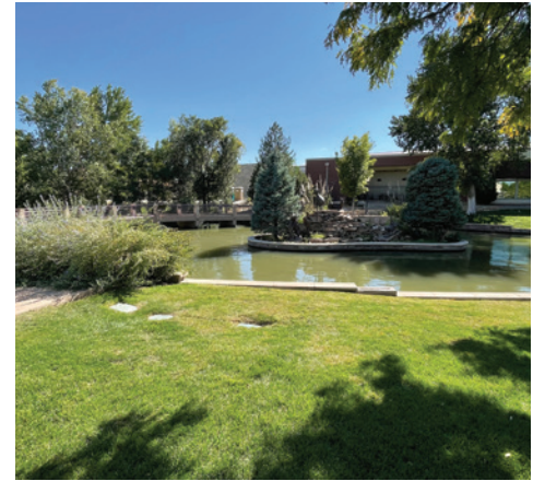
Above: Pueblo Riverwalk.

When you crawl out from your tent in the morning, head across the street to Loyal Coffee. 2 Grab a caffeinated drink to go because you have a lot to see. Walk north on the main drag, Tejon Street, and enjoy all the eccentric, fun, and city-funded sculptures and art. Be on the